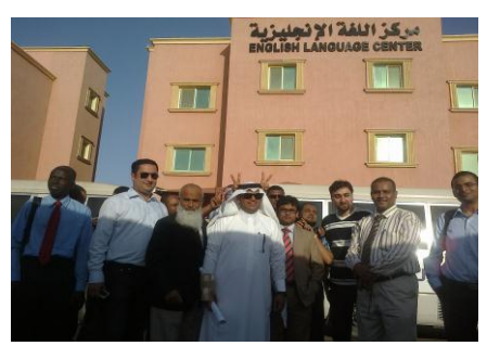
A view of ELC Teaching Staff, Jazan University